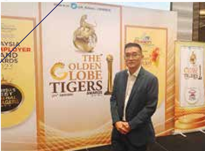
Honoured with the Healthcare Leadership Award at the 11th Edition Golden Globe Tigers awards ceremony held on 16, May 2023 in Kuala Lumpur.