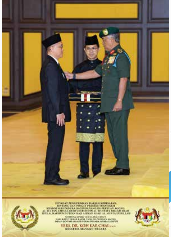
Bestowed with the "Kesatria Mangku Negara" by KDYMM Seri Paduka Baginda Yang Di-Pertuan Agong, Al-Sultan Abdullah Ri'ayatuddin Al-Mustafa Billah Shah ibni Almarhum Sultan Haji Ahmad Shah Al-Musta'in Billah on 9, January 2024 at Istana Negara, Kuala Lumpur.

Warmest regards, Secretary Manipal Alumni Association of Malaysia (MAAM)