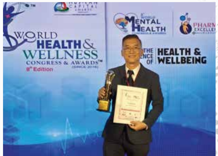
Received the Healthcare Leadership Award certified by the World Federation of Healthcare Leaders at the 8th World Health & Wellness Congress & Awards on 16, Feb, 2024 at Mumbai, India.